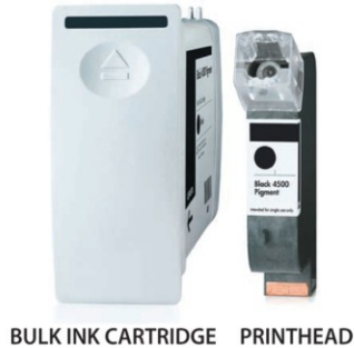
BULK INK CARTRIDGE PRINthead