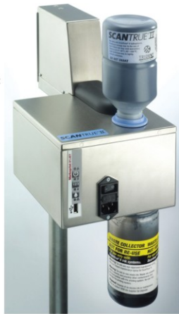
Autoprint X1JET MX 100 Compact All the controls are housed in this compact system.

The compact "all-in-one" Piezo printer combines printhead, ink system, rinsing and cleaning station, control electronics and mains unit in one enclosure.