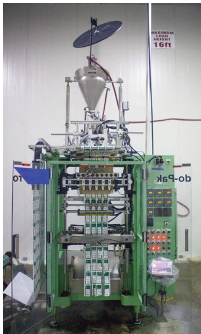
Tessemae's installed a thermal ink-jet printer on its vf/f/s machine to add Best By date codes to rollstock for its salad dressing sachets.

The vf/f/s pouch line is now equipped with ATIP's X4Jet print controller with two single ATIP Autoprint print heads that print on four pouches simultaneously. Pouches measure 3 x 5.5 in. and are constructed of 48-ga PET/four-color print/adhesive/0.025-mil EVOH