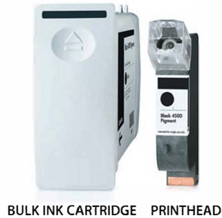
BULK INK CARTRIDGE PRINTHEAD