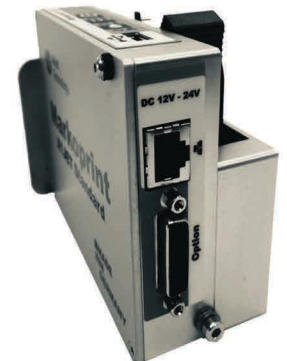
Ethernet Data Transfer from networks and Web Interface