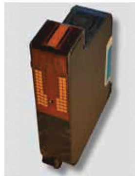
Maintenance-free HP cartridge Perfect print quality - High reliable inks with up to 15 hours decap