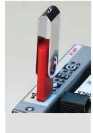
USB stick data transfer Dynamically transfers Data created with a PC to the printer