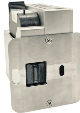
Front Deflector Plate With Built-In Photo Eye