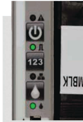
3-Logic User Interface LED indicators for intuitive use

Compact, independently operating printhead for simple integration into existing production lines.