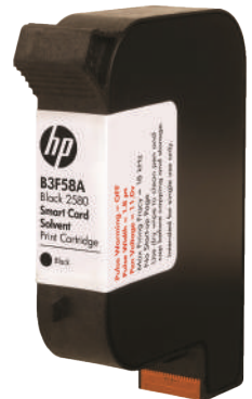
HP 2580 Black Solvent Ink

Watch our inkjet in action at www.atip-usa.com/video